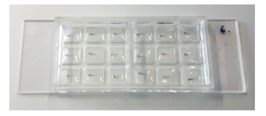
Figure 1: Zebra fish larvae embedded in LMPA in a µ-Slide 2 Well Co-Culture.